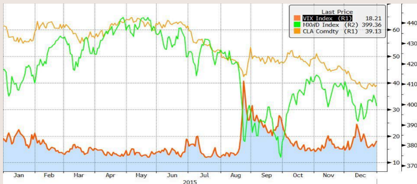
Chart 1: Movements in the VIX, the MSCI ACWI (MXWD) index, and crude oil price (CLA) for the year 2015

Globally, equity markets ended the year with slightly mixed, but mainly negative returns. Table 1 below highlights the quarterly and annual returns on major indices for 2015. In US equity markets, the broad DJ US Total Stock Market Index and the S&P 500 posted gains of +0.4% and +1.4% respectively for the year 2015. Non-US developed market and emerging market equities erased gains earned in the first half of the year with the benchmark indices, MSCI EAFE and MSCI EM respectively, ending the year with returns of -0.8% and -14.9% respectively. Natural resources also provided investors with negative returns in the face of a strong US dollar and continuing conditions of oversupply relative to demand, with the benchmark S&P Natural Resources index posting a loss of -24.3% in 2015. Global fixed income also came under pressure throughout the year, posting three quarterly losses and providing investors with a -3.6% return, as measured by the Citi WGBI.